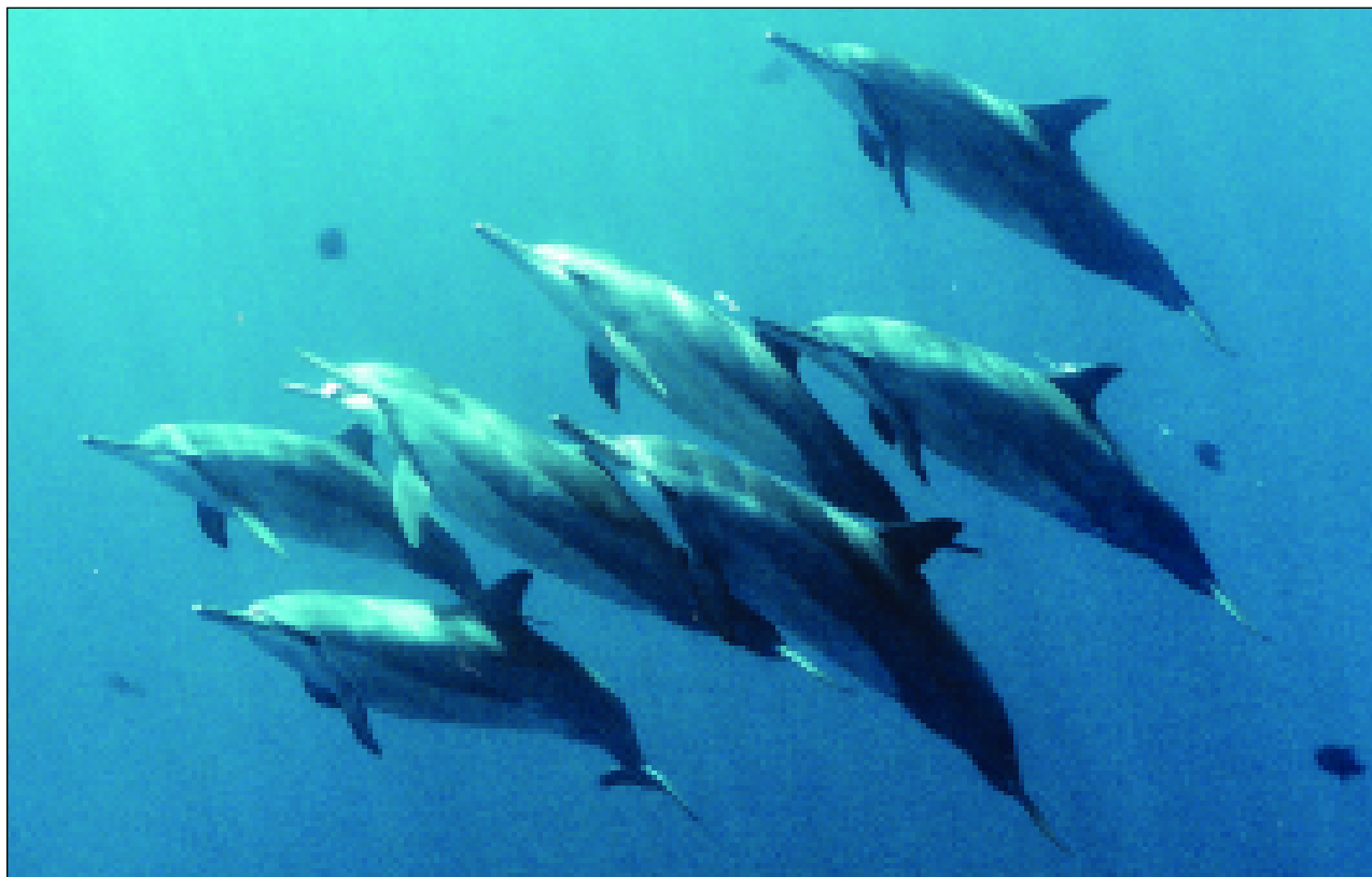
Fig. 1. A resting group of spinner dolphins ( Stenella longirostris ) swimming in formation at cruising speed, about to surface for breathing. Note the tongue of one dolphin hanging out of its open mouth.

Suckling began when a calf would position itself at its mother's side whilst nudging the mammary slit with the tip of its beak (Fig. 3). The calf's glottis was seen to move as the milk was taken from the mammary slit by suckling movements. Whilst the calf was suckling its eyes remained wide open, the tongue appeared to move and the sternohyoid muscle was contracting. After suckling at one side of the mammary slit, the calf moved to the opposite side. Suckling lasted between