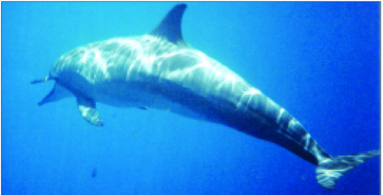
Fig. 8. A spinner dolphin taking water before vomiting. Note open mouth and distended throat.

phins stayed within the bay. Shortly before defaecating, a dolphin would bend its body into a slight sigmoid curve directed backwards (Fig. 7) and then eliminated a variable amount of faeces, which formed a cloud in the water (see Sazima et al. , 2003). When the quantity of faeces was small, the dolphin defaecated without noticeable changes in behaviour while cruising or swimming. The faeces were eliminated irre-