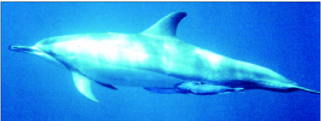
Fig. 12. A recruit-of-the-year whalesucker attached to the throat of a spinner dolphin (above), and two adult fish on the belly and flank of another (below).