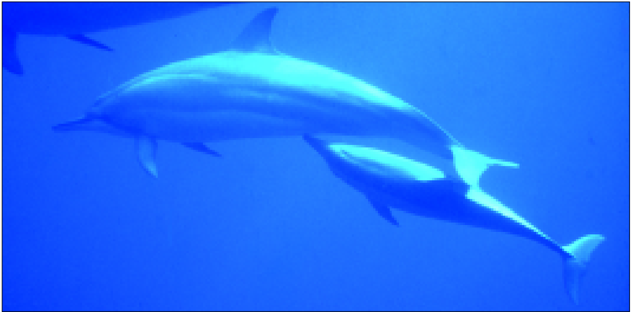
Fig. 3. A juvenile spinner dolphin about to suckle, nudging the female's genital slit with its beak.