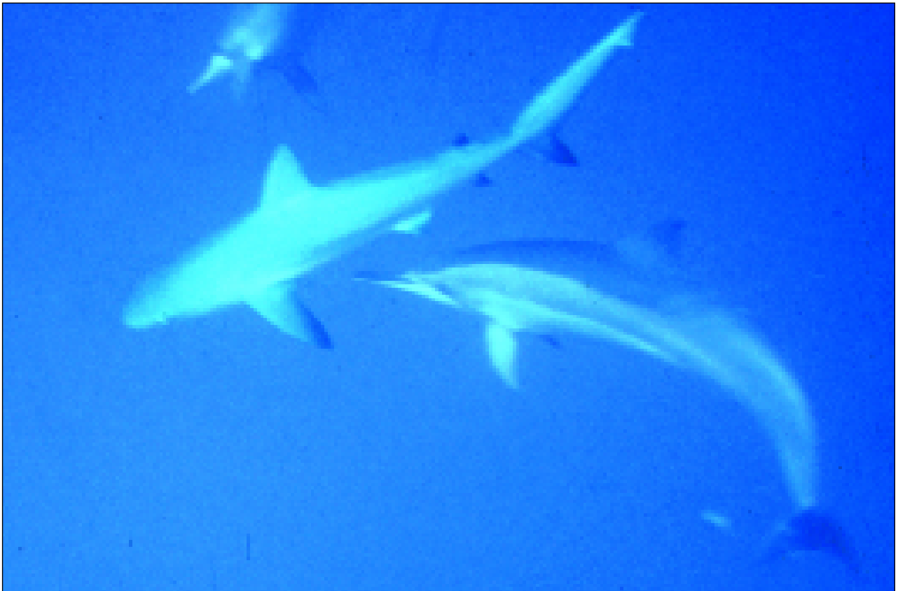
Fig. 10. Two male spinner dolphins chasing a Caribbean reef shark ( Carcharhinus perezii ).