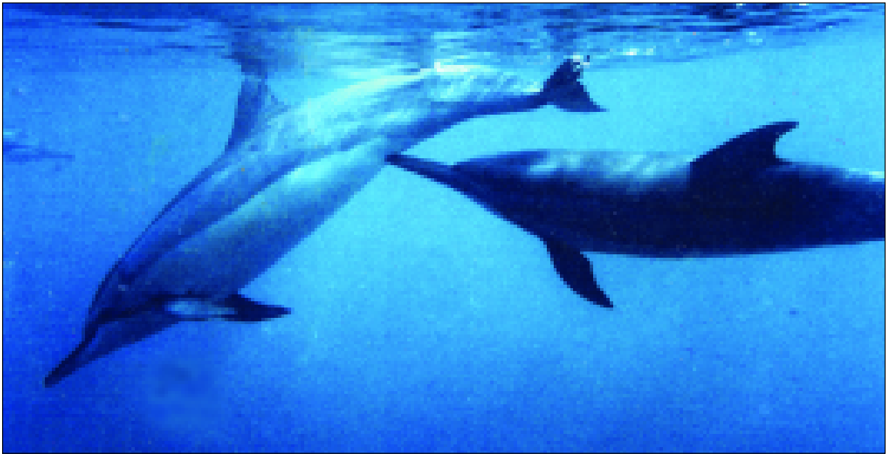
Fig. 5. A spinner dolphin male nudging the genital slit of a female with its beak.