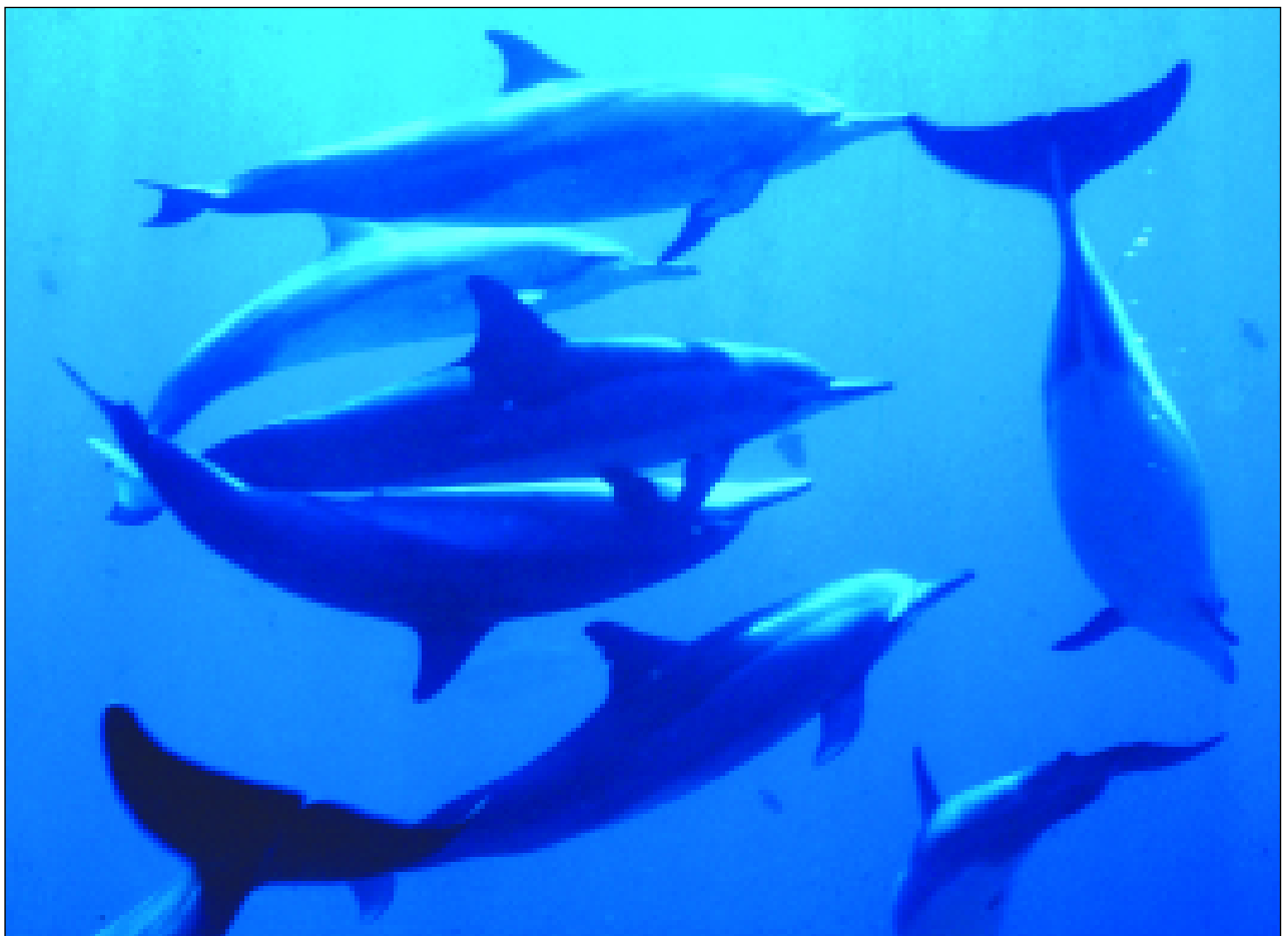
Fig. 6. A group of spinner dolphin males surrounding a female, one male (upside down) copulating.