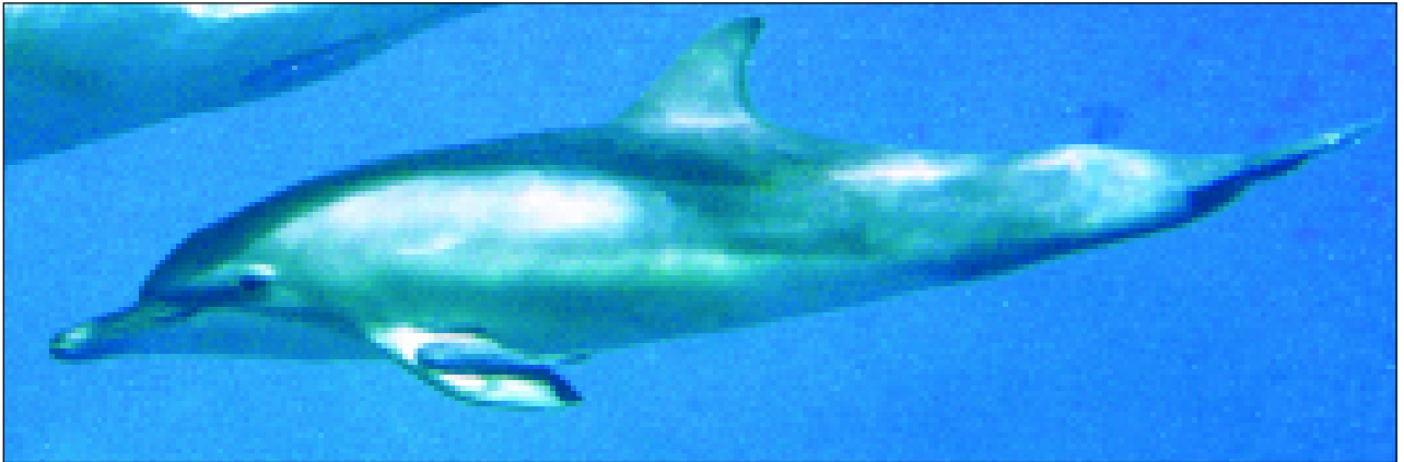
Fig. 11. A juvenile whalesucker ( Remora australis ) attached to the left flipper of a spinner dolphin calf. Note abraded skin on the fluke's upper side.