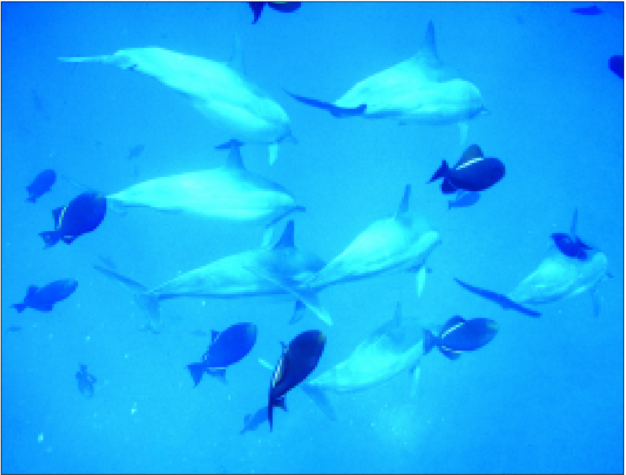
Fig. 14. A group of black durgons following a group of resting spinner dolphins cruising at low speed.

a while (Fig. 9), then release it and place it on the other flipper, or its tail or beak. A dolphin may play repeatedly in this way with the same piece of seaweed, or let it drift away after holding it on the flipper for a while or after a tail pass. During the play, the dolphin would not have any problems balancing and holding on to the seaweed, irrespective of its manoeuvring within the group. If then dropped, the same piece of seaweed may be taken by a following or flanking dolphin, which would play with it for a while in the same way. We also recorded two dolphins playing together with the same piece of seaweed, each of them taking its turn, up to about 10 times over the study period. Sometimes two or three dolphins in an observed group carried a seaweed piece each.