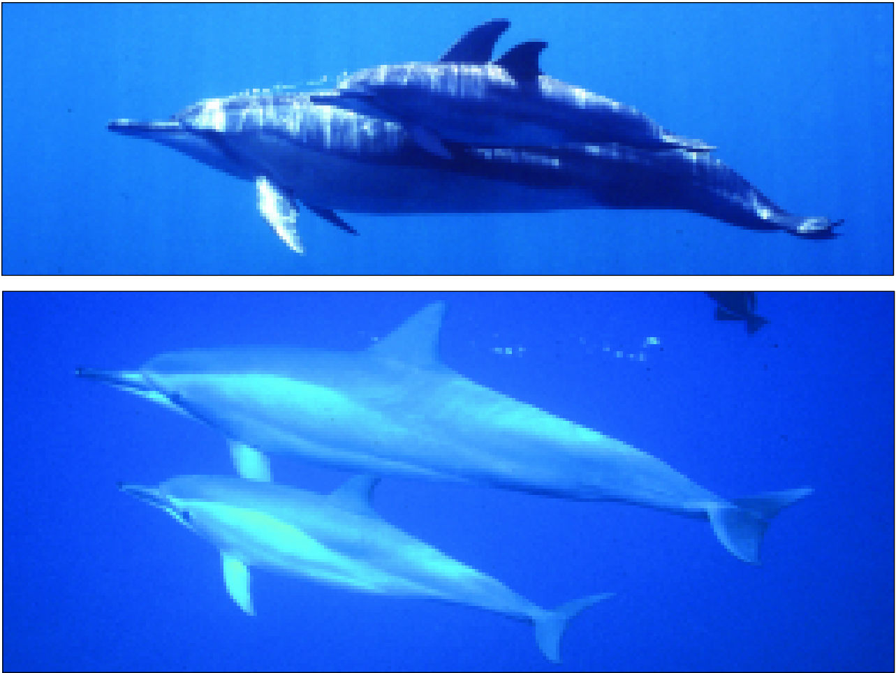
Fig. 2. A nursing spinner dolphin female and a calf shortly after breathing at surface (above); a female and a still suckling juvenile swimming side by side (below).

five and 20 sec (mean = 11.25; SD + 4.34; N = 16). Twice we recorded the calf taking milk which was squirted from the mammary slit, as if the liquid were taken through an “invisible” pipe. Once a calf was recorded taking mouthfuls of milk ejected from the mammary slit as into the water. Suckling calves ranged from the newborn (identifiable by their neonatal skin folds) to juveniles up to about 130 cm in length.