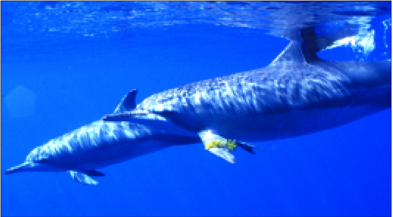
Fig. 9. Two spinner dolphins playing with a piece of seaweed ( Sargassum sp.), one of them holding the “toy” on its left flipper.