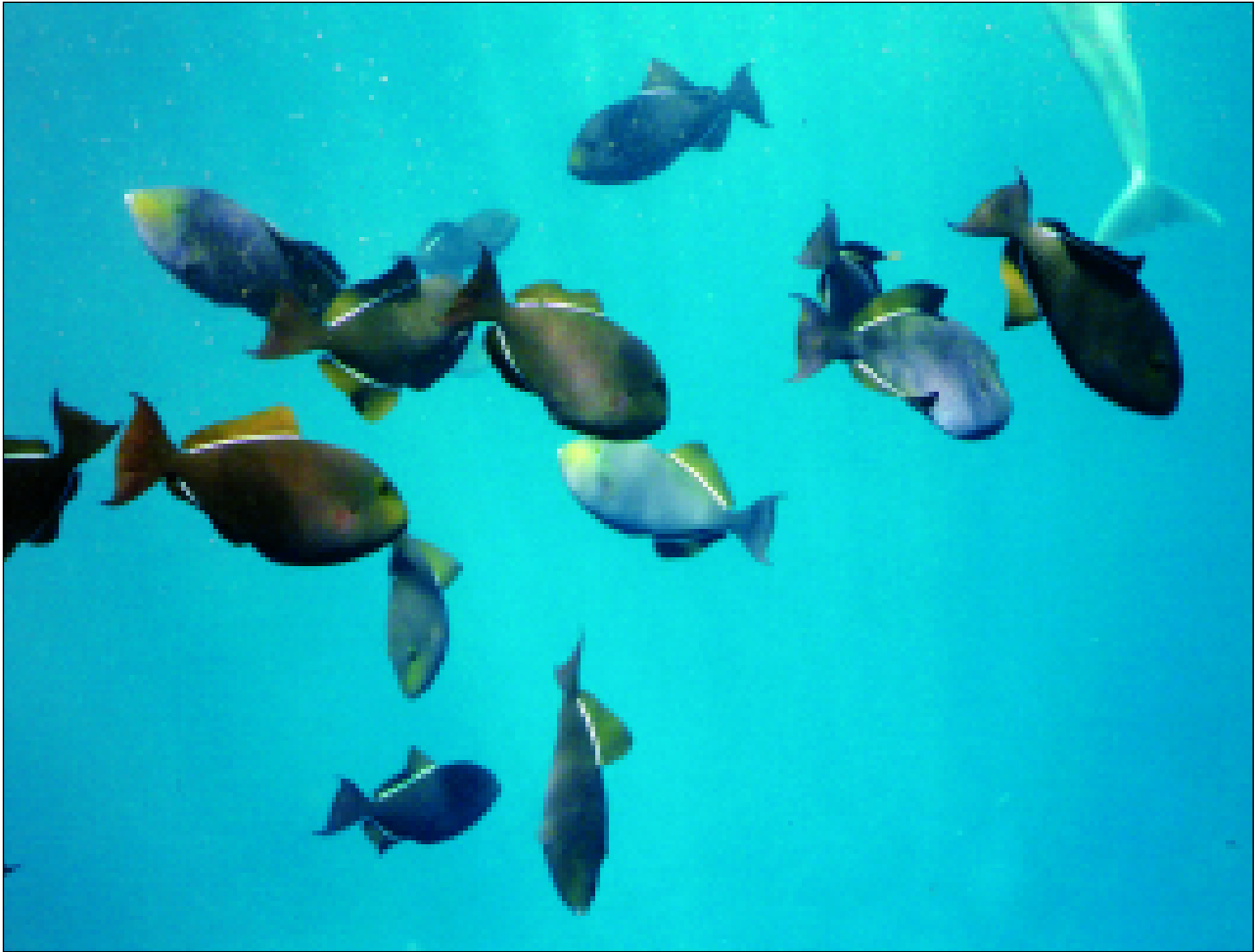
Fig. 13. A group of black durgons ( Melichthys niger ) picking up particulate spinner dolphin faeces.

Vomiting was not as common a behaviour as defaecation, the ratio of defaecation to vomiting events varying between 3:1 and 20:1 (see Sazima et al. , 2003). Water and rarely air was taken in before vomiting occurred. While swimming with its mouth open, the dolphin took in a mouthful of water (Fig. 8), which caused its throat and mouth floor to bulge. Occasionally the dolphin's tongue hung out of its mouth during the intake of water (Fig. 1). Six distinct phases of vomiting behaviour are described and illustrated by Silva Jr. et al. (2004), with the entire sequence lasting about eight to fourteen seconds. Vomiting was generally preceded by a short burst of speed, after which the dolphin usually bent its body in a slight sigmoid curve directed forwards (lateral movements of the hind body might occur at times), and vomited with its mouth wide open. Vomiting was apparently related to a previous night's feed on meal rich in squid, as the vomit included pieces of squid and beaks, as well as particulate or amorphous material (see Silva Jr. et al. , 2004 for details), and live roundworms ( Anisakis sp., Anisakidae). We never recorded a vomit consisting only of fish meal.